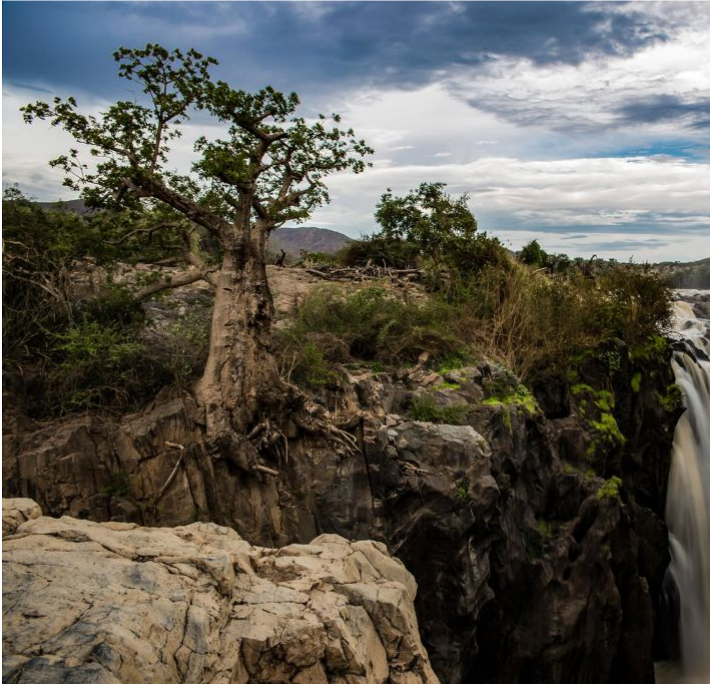
Epupa Falls: Dramatic cascades along the Kunene River, surrounded by rugged cliffs and baobabs.