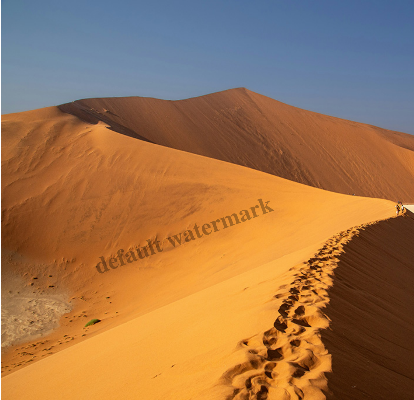
Sossusvlei Dunes: Some of the world's most photographed dunes, glowing orange in shifting desert light.