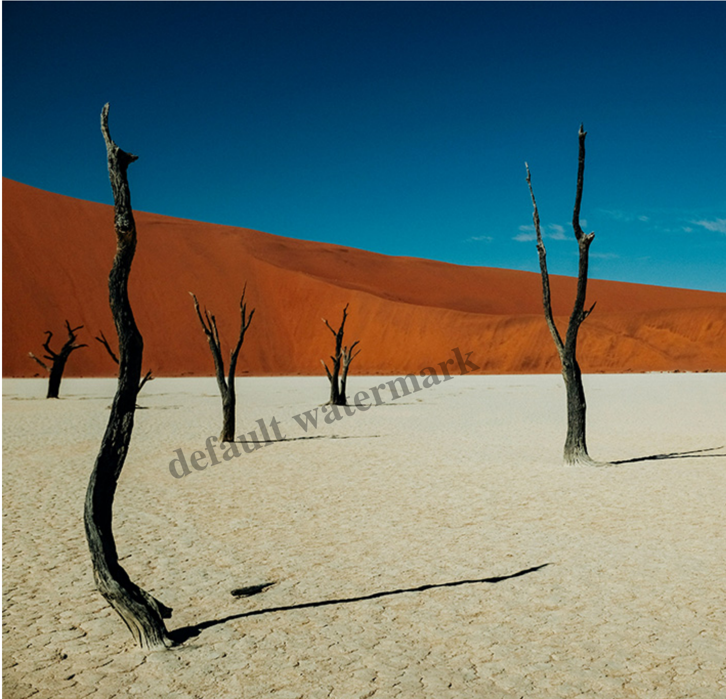
Deadvlei, Sossusvlei: Ancient camelthorn trees rising from a white clay pan beneath towering red dunes.