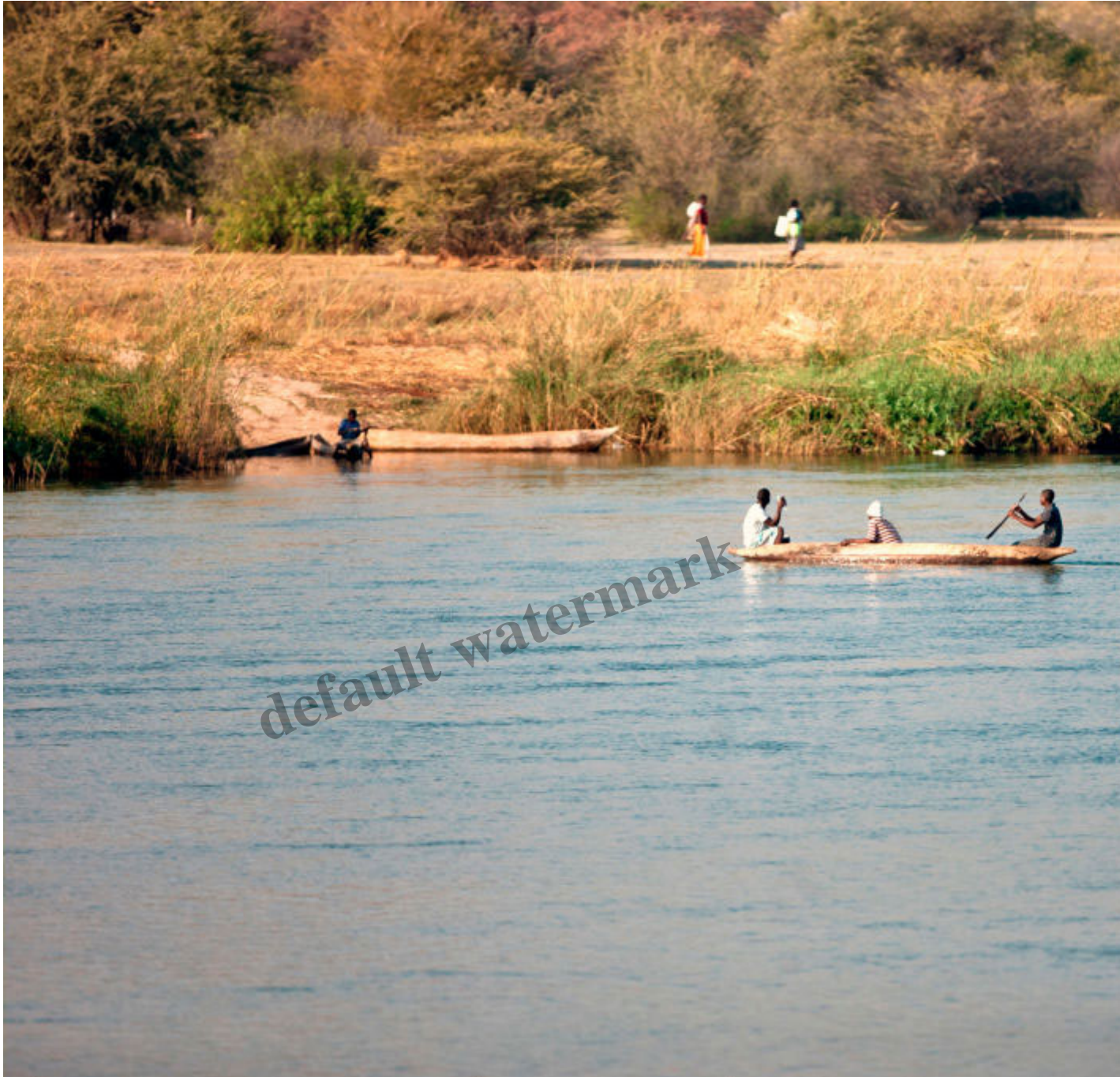
Kavango Region: Lush river landscapes shaped by the Okavango River and traditional homesteads.