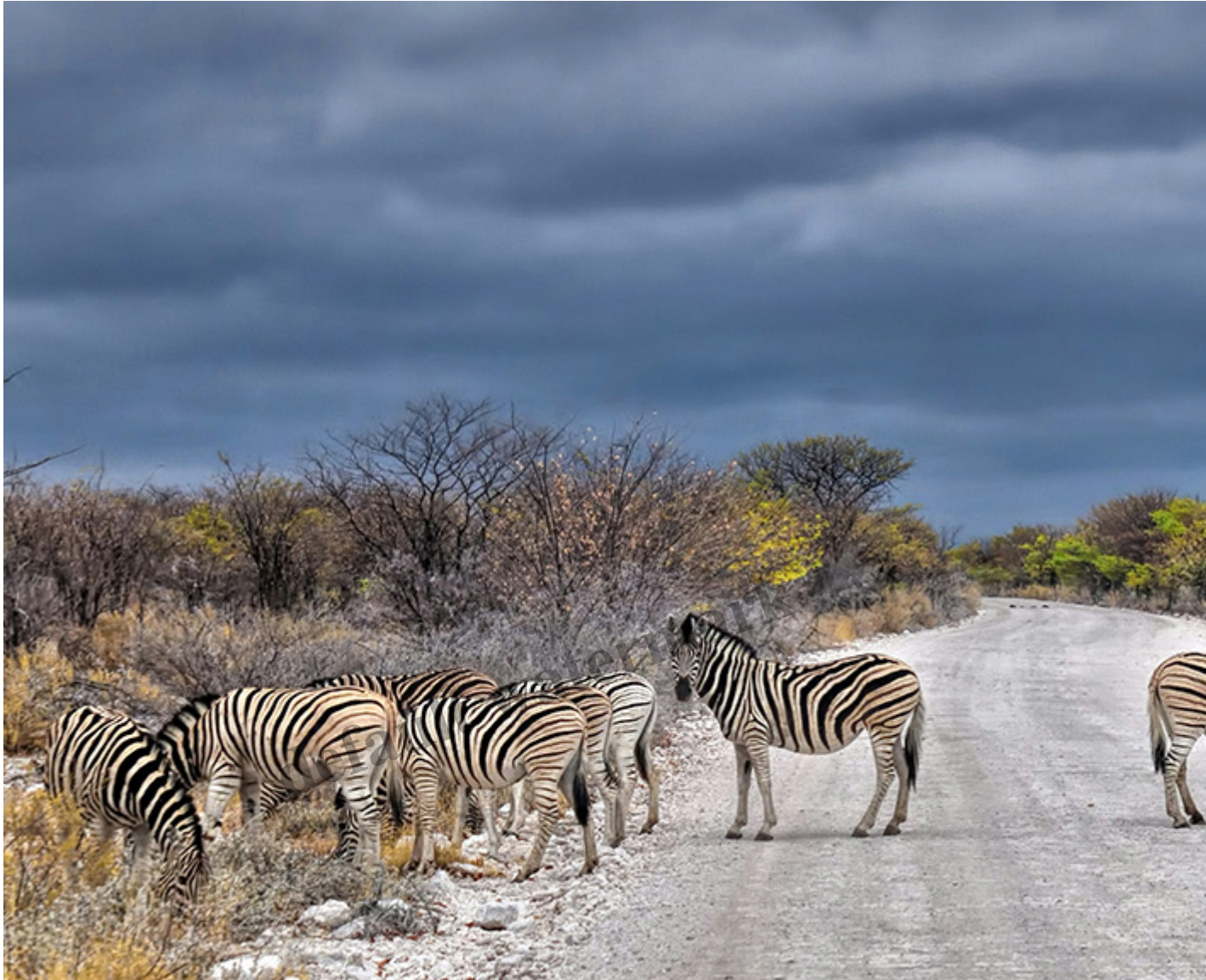
Etosha National Park: One of Africa's great wildlife reserves, home to elephants, lions, giraffes and vast salt pans.