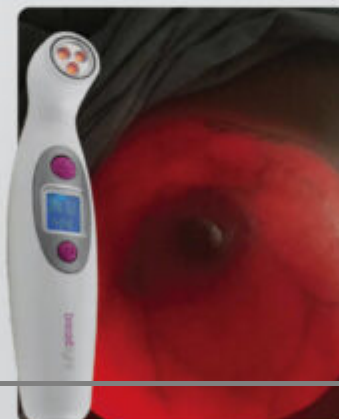
HEALTHY BREAST VS BREAST ABNORMALITY