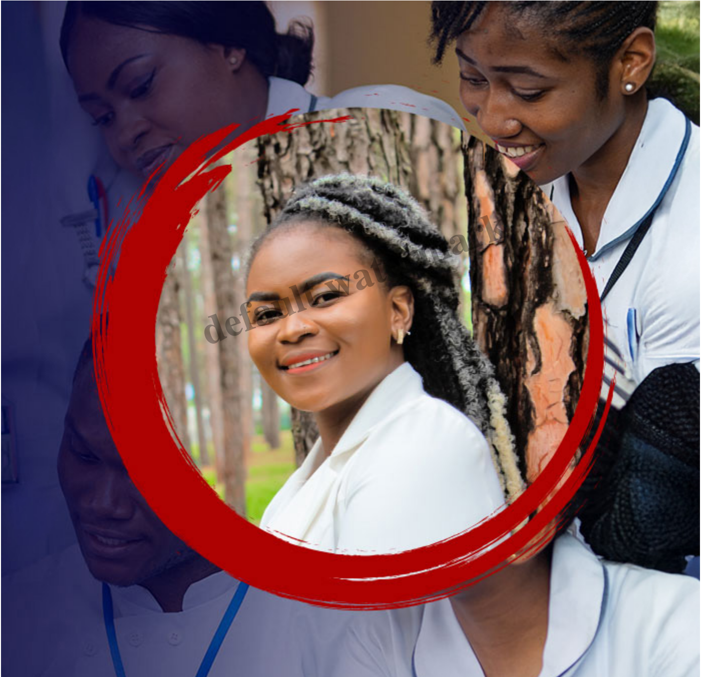
International Nurses Day