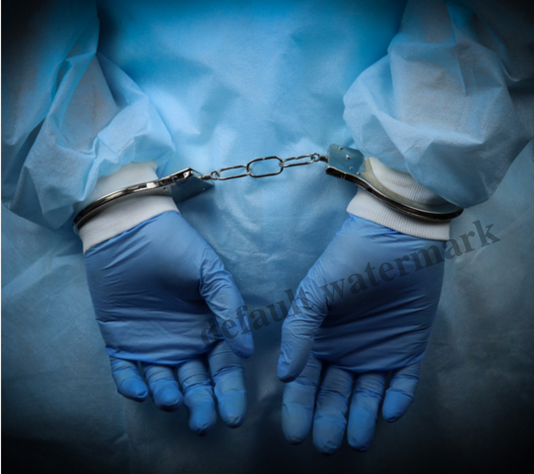
Our Knowledge Centre